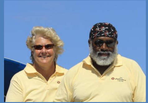
Jamann Sailing Adventures

Knowing that a lot of our guests will want to see the sites and visit the anchorages on the islands that make up the US Virgin Islands we spent 2 weeks in June sailing around St. Thomas and St. John, having sailed to St. Croix back in 2008. The US Virgin Islands are only a short distance from the British Virgin